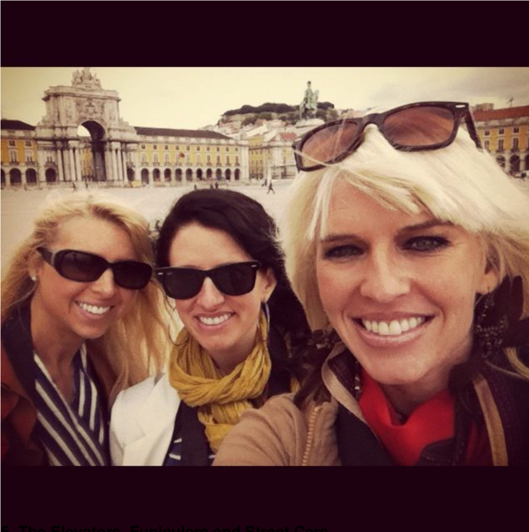
5. The Elevators, Funiculars and Street Cars

Thursday, 14 June 2012 17:17 - Last Updated Wednesday, 20 June 2012 15:22